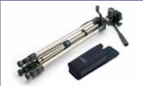
Tripod adapter, tripod, calibration certificate, belt pouch.